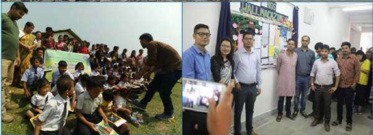
Gorubathan Government College NSS Unit – I and the glimpse its various activities. (A) Unit Program Officers, Subject Experts and Volunteers participating Nature Study Tour to Bengal Safari, (B) NSS Volunteers distributing essential study materials to the Primary School Students at Lower Fagu, (C) Opening of NSS Wall Magazine.