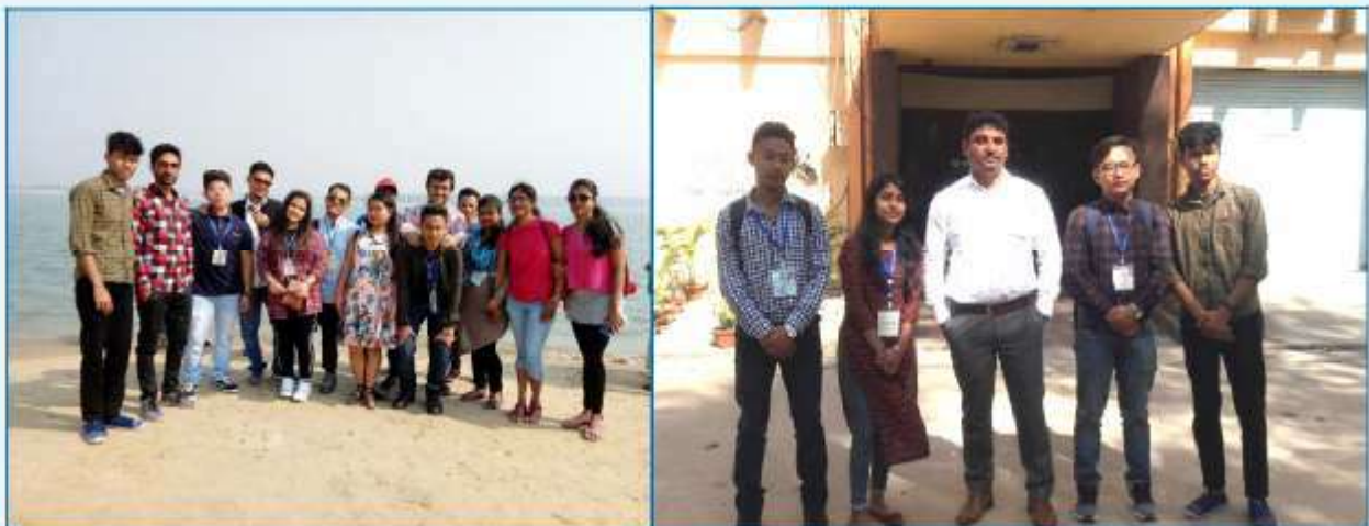
Students and teachers from the department of Botany and Zoology during their field visit to Digha and Zoological Survey of India, Kolkata in 2019.

The study tours are of the great importance to the students. It allows them not only to have a practical out-look but also explore deep into the subject. Gorubathan Government College conducts local study tours for all the 1 st year students to fulfil the requirement of environmental science compulsory course. Gorubathan is literally situated on the lap of the Himalaya and blessed with beautiful natural wealth of mind blowing landscape, evergreen forest with great floral and faunal diversity, dancing streams and fast flowing rivers with cool crystal clear water and ever pleasant weather. They provide the students ample opportunities to analyse the ecological aspects and biodiversity of the area by taking part in the field survey and interaction programme with local inhabitants of gorubathan. It also makes the future generation aware of the environmental values and helps to develop mass awareness for the conservation of biodiversity. Department of Botany and Zoology also conduct study tours for 'Honours' and 'General' students.