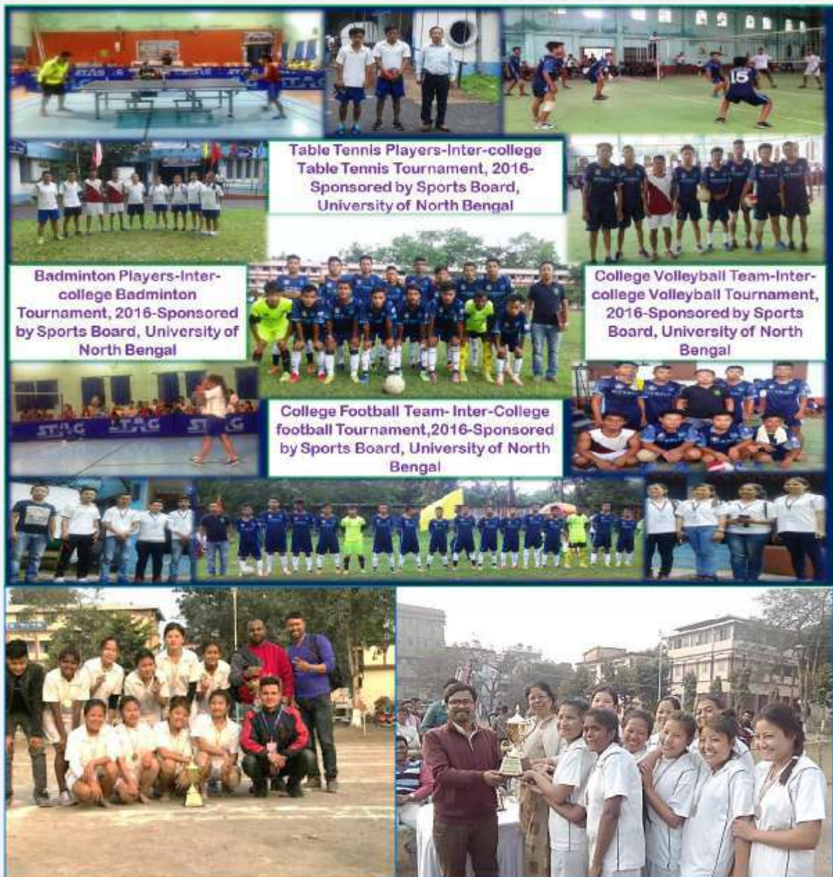
DPI - Inter College Games and Sports Championship 2017-18, Organized by Siliguri College