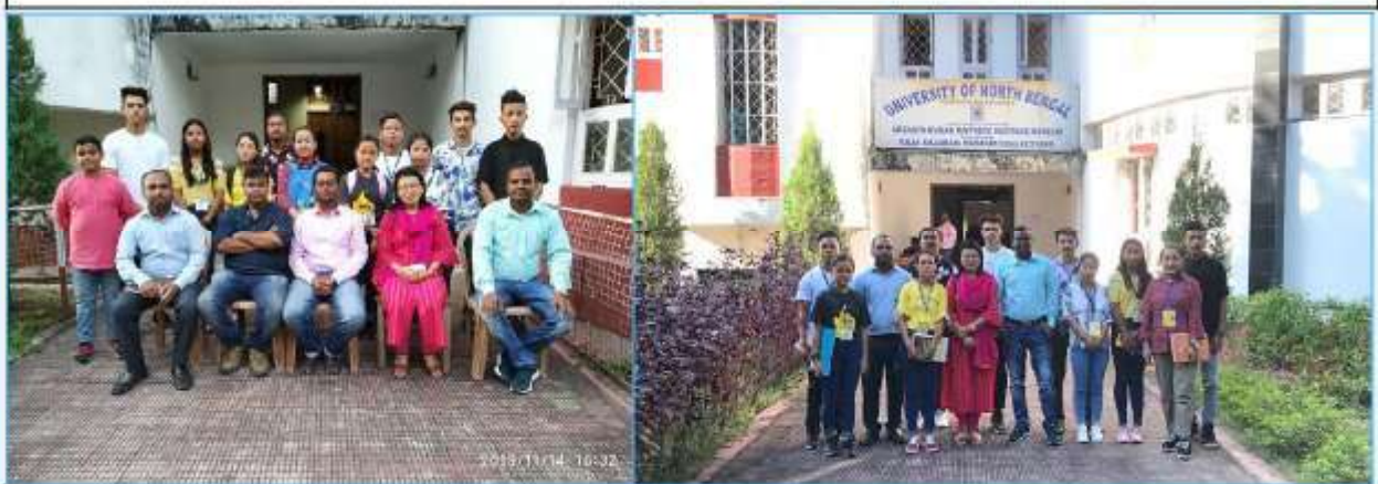
College team from the History Department of our college with the faculty members of History department, NBU. Team at the 'Akshaya Kumar Maitreya heritage Museum' during their visit to University of North Bengal, in 2019