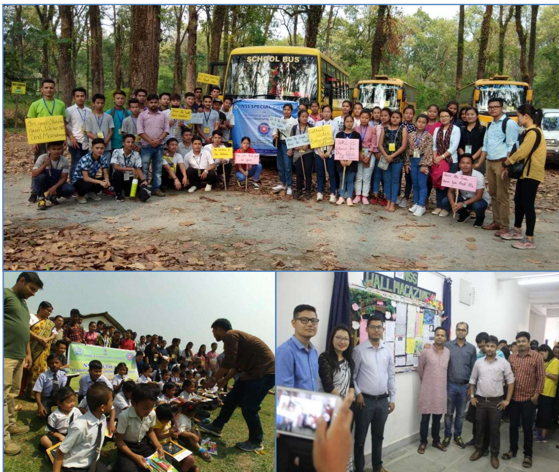
Gorubathan Government College NSS Unit – I and the glimpse its various activities. (A) Unit Program Officers, Subject Experts and Volunteers participating Nature Study Tour to Bengal Safari, (B) NSS Volunteers distributing essential study materials to the Primary School Students at Lower Fagu, (C) Opening of NSS Wall Magazine.