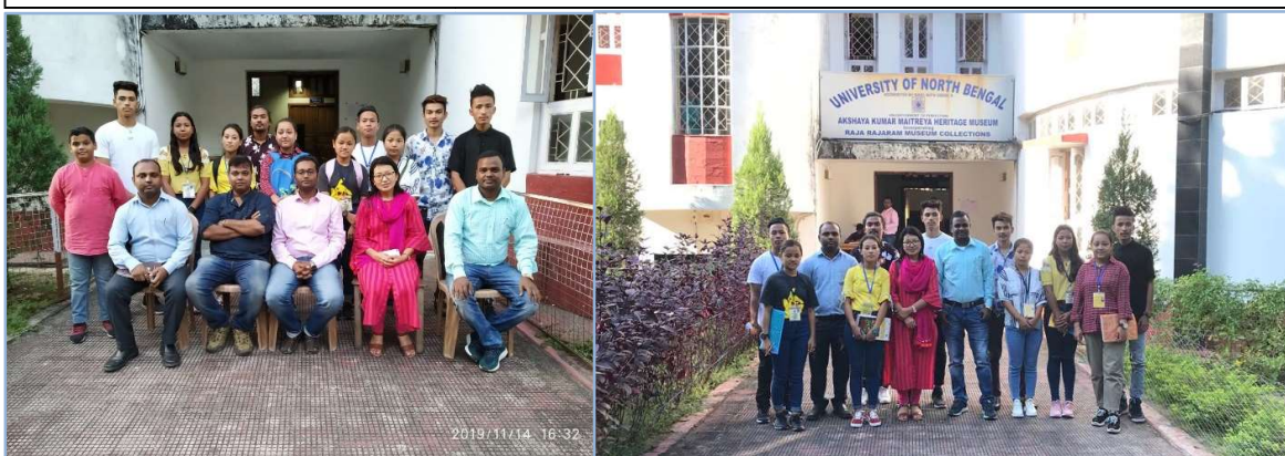
College team from the History Department of our college with the faculty members of History department, NBU. Team at the 'Akshaya Kumar Maitreya heritage Museum' during their visit to University of North Bengal, in 2019