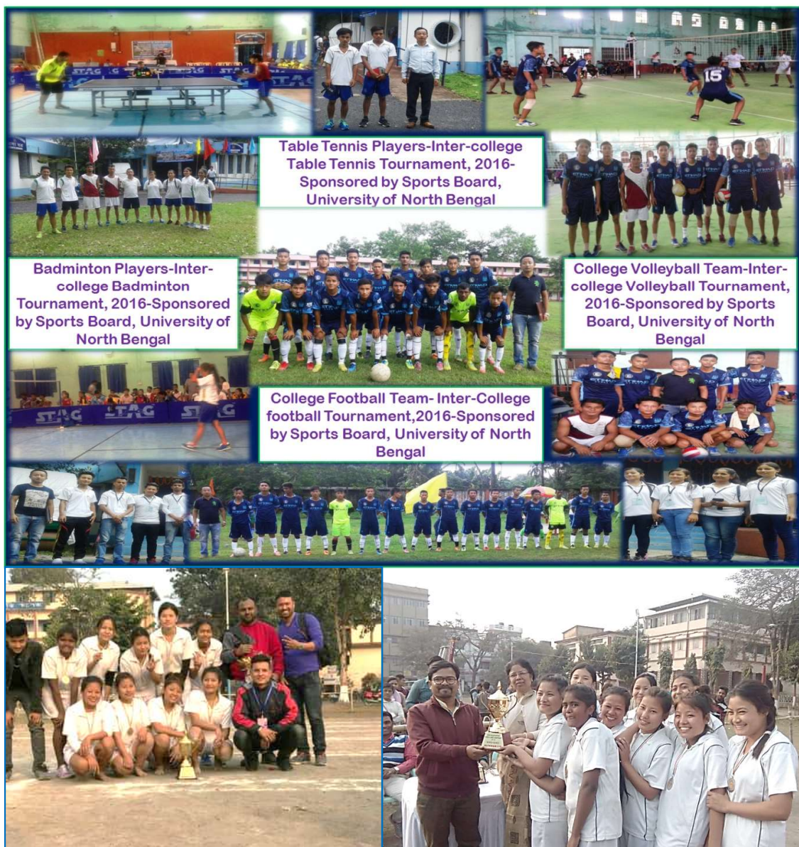
Inter-college girls Kho-Kho runner up team - 2019 – sponsored by Sports board, University of North Bengal