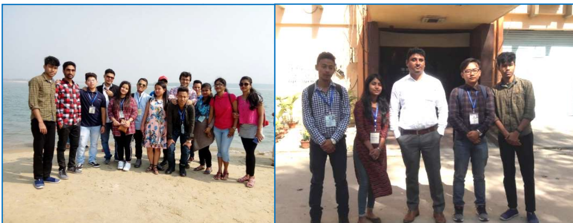
Students and teachers from the department of Botany and Zoology during their field visit to Digha and Zoological Survey of India, Kolkata in 2019.

The study tours are of the great importance to the students. It allows them not only to have a practical out-look but also explore deep into the subject. Gorubathan Government College conducts local study tours for all the 1 st year students to fulfil the requirement of environmental science compulsory course. Gorubathan is literally situated on the lap of the Himalaya and blessed with beautiful natural wealth of mind blowing landscape, evergreen forest with great floral and faunal diversity, dancing streams and fast flowing rivers with cool crystal clear water and ever pleasant weather. They provide the students ample opportunities to analyse the ecological aspects and biodiversity of the area by taking part in the field survey and interaction programme with local inhabitants of Gorubathan. It also makes the future generation aware of the environmental values and helps to develop mass awareness for the conservation of biodiversity. Department of Botany and Zoology also conduct study tours for 'Honours' and 'General' students.