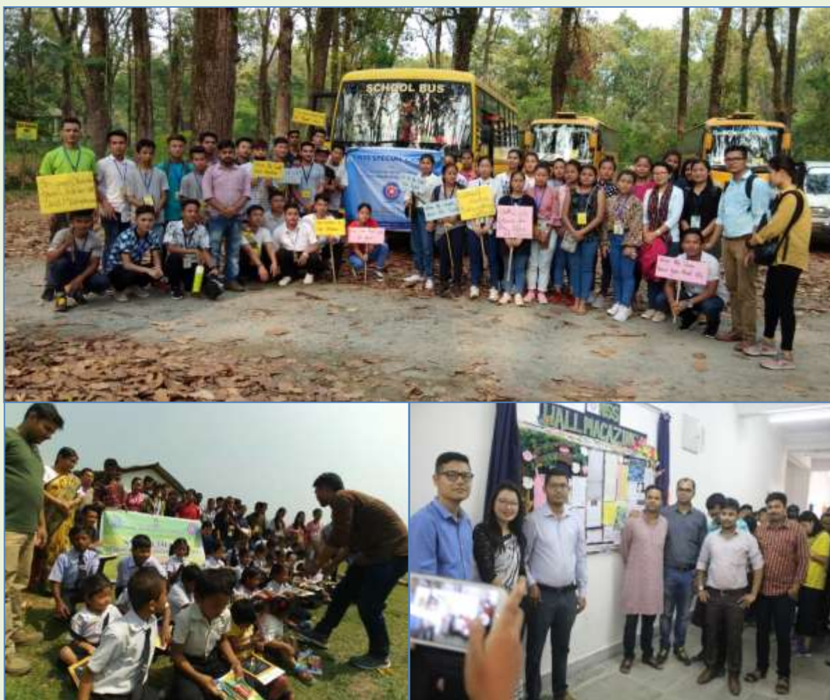
Gorubathan Government College NSS Unit – I and the glimpse its various activities. (A) Unit Program Officers, Subject Experts and Volunteers participating Nature Study Tour to Bengal Safari, (B) NSS Volunteers distributing essential study materials to the Primary School Students at Lower Fagu, (C) Opening of NSS Wall Magazine.