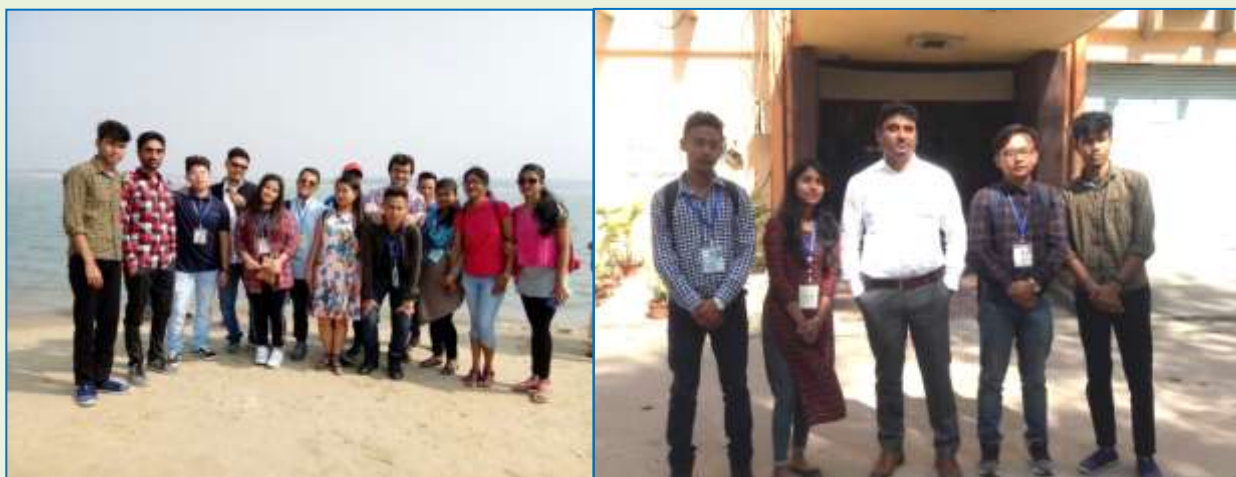
Students and teachers from the department of Botany and Zoology during their field visit to Digha and Zoological Survey of India, Kolkata in 2019.

The study tours are of the great importance to the students. It allows them not only to have a practical out-look but also explore deep into the subject. Gorubathan Government College conducts local study tours for all the 1 st year students to fulfil the requirement of environmental science compulsory course. Gorubathan is literally situated on the lap of the Himalaya and blessed with beautiful natural wealth of mind blowing landscape, evergreen forest with great floral and faunal diversity, dancing streams and fast flowing rivers with cool crystal clear water and ever pleasant weather. They provide the students ample opportunities to analyse the ecological aspects and biodiversity of the area by taking part in the field survey and interaction programme with local inhabitants of Gorubathan. It also makes the future generation aware of the environmental values and helps to develop mass awareness for the conservation of biodiversity. Department of Botany and Zoology also conduct study tours for ‘Honours’ and ‘General’ students.