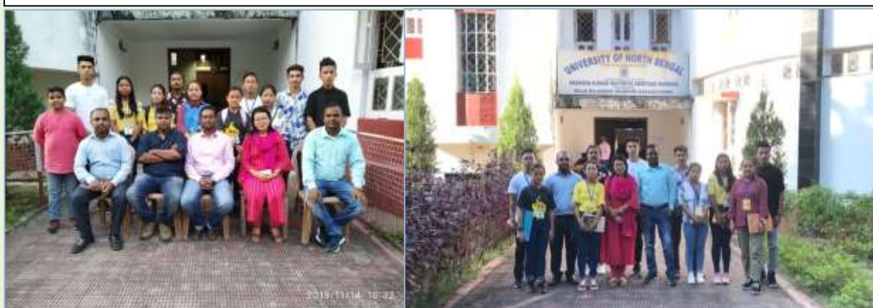
College team from the History Department of our college with the faculty members of History department, NBU. Team at the ‘Akshaya Kumar Maitreya heritage Museum’ during their visit to University of North Bengal, in 2019